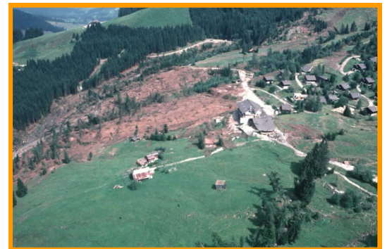
1994 Falli Hölli landslide with a displacement of 250 m in 4 months